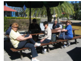
Relaxing on Magnetic Island