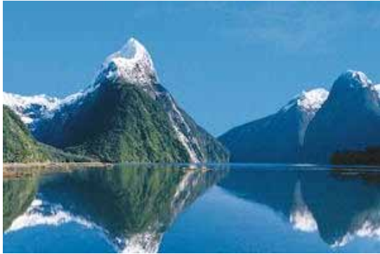
Mitre Peak in Milford Sound