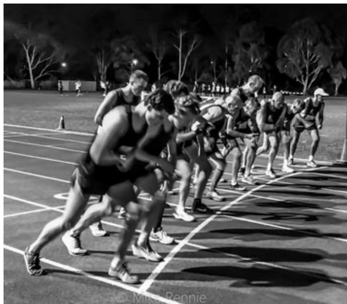
The start of the fast heat.