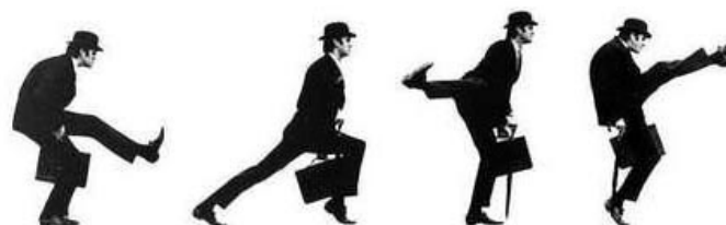
Incorrect Technique. Knee bent on contact.