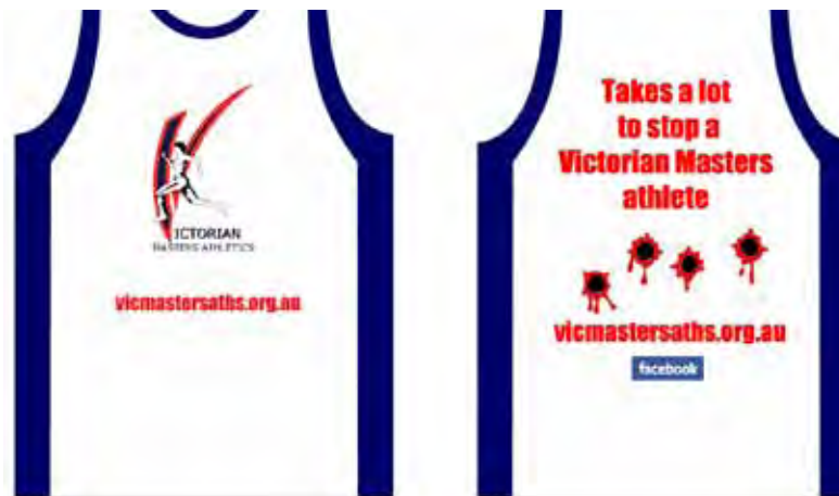
The "bullet hole" singlet

Contact Russ if you have any ideas/ opinions dicko@iinet.net.au