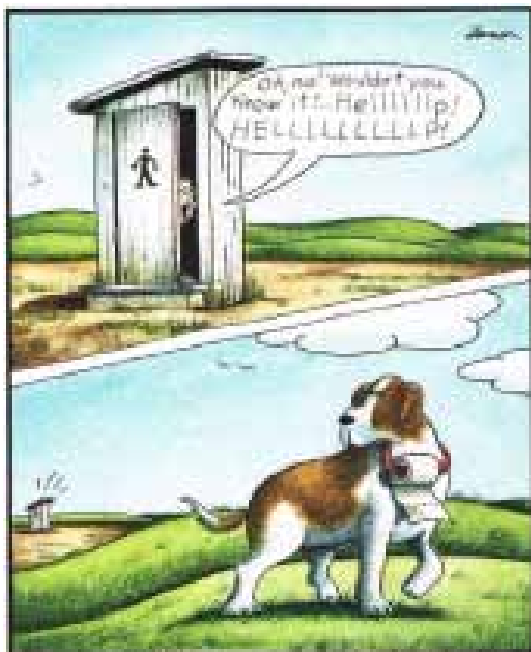
Far away, on a hillside, a very specialized breed of dog heard the cry of distress.