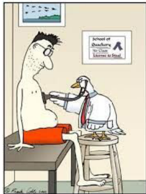
Frank started to get a funny feeling that his doctor was a quack.