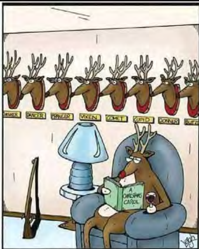
All of the other reindeer used to laugh and call him names.