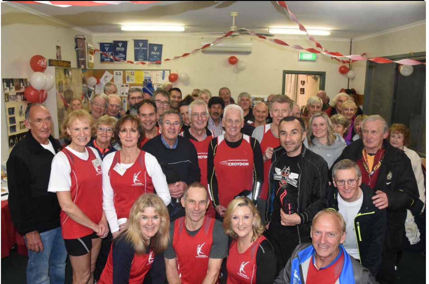
Happy 40th Birthday Croydon !!!