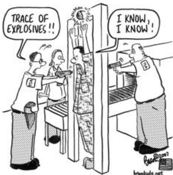
When E.O.D. flies commercial