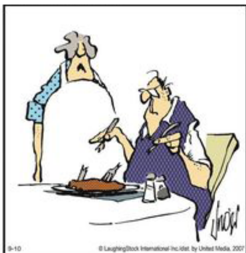
© LaughingStock International Inc./dist. by United Media, 2007 "Use your fingers."