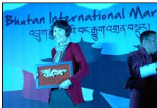
Figure 4: receiving my second place trophy

Half Marathon Results: Taken from the BOC website Men