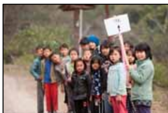
Figure 3: Local village children.

I then heard about the Inaugural Bhutan International Marathon organized by the Bhutan Olympic Committee (BOC) and decided to enter the Half Marathon event.