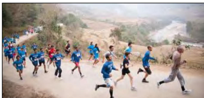
Figure 1: Early in the race. I'm in black.

runner, so I wasn't sure if it was a culturally appropriate sport. I did however spot an athletics track in the capital city so figured that some running must take place. I asked around and was told that running is fine, but not many people do it. My first run in the capital city Thimphu was only 2 weeks after landing. At an elevation of 2350metres, I felt like an elephant and wondered how I would ever run.