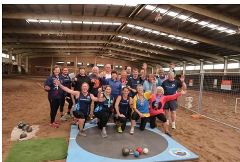
And the NSW Masters Throwers at a similar venue in Sydney.