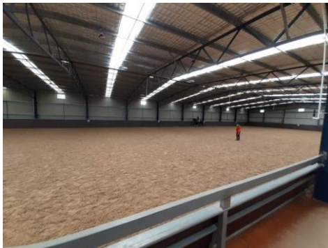
Above is a photo of the proposed venue for our first competition which is an equestrian venue in Wonga Park.

We have been lucky to be offered the services of Simon van Baalen's brother-in-law who has all the skills and tools necessary to construct the portable throwing circle required. Once completed we will be seeking some volunteers to help paint it ready for use.