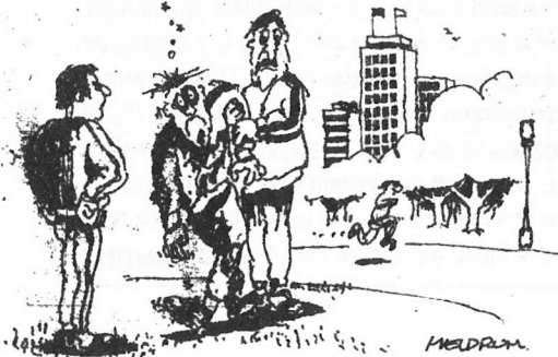
"He had a blow out in his left sandshoe."

IF YOU WOULD LIKE TO BE KEPT UP-TO-DATE, FILL IN THE FORM BELOW AND FUTURE DETAILS WILL BE SENT DIRECTLY TO YOU.