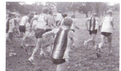
Start of Cross Country